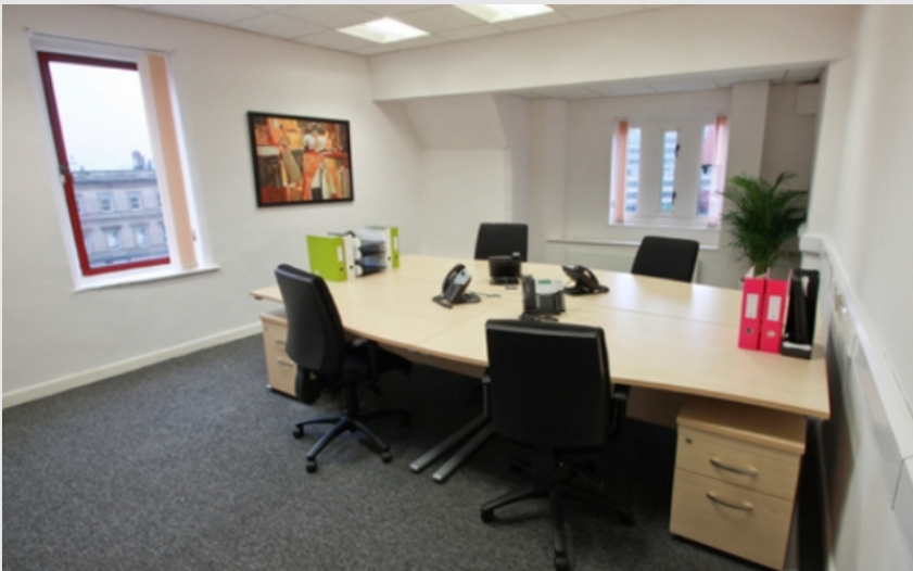
This office has lovely views over The Market Square

Foxhall Business Centre, Two King Street, Nottingham NG1 2AS