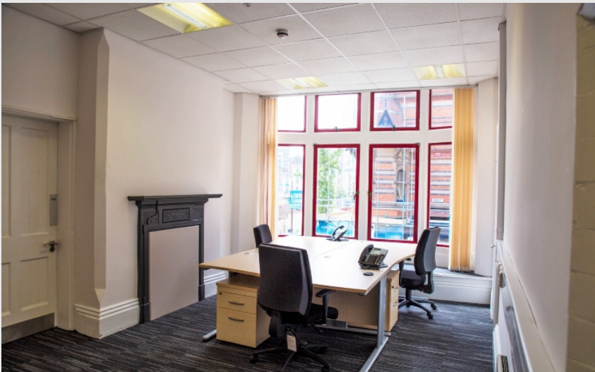
Views of Old Market Square

Foxhall Business Centre, Two King Street, Nottingham NG1 2AS